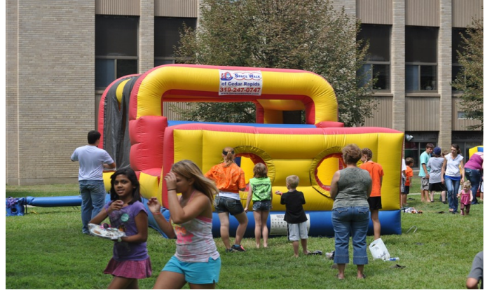
Fun Days fun in Butler Park!