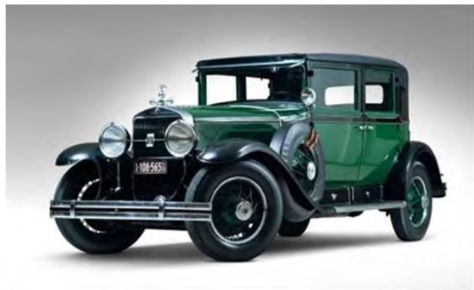
Al Capone's Car

Al Capone's 1928 Cadillac V-8 "Al Capone" Town Sedan Became the President's Limo on December 1941. Mechanics are said to have cleaned and checked each feature of the Caddy well into the night of December 7th, to make sure that it would run properly the next day for the Commander in Chief. And run properly it did. It had been painted black and green to look identical to Chicago's police cars at the time. To top it off, the gangster's 1928 Cadillac Town Sedan had 3,000 pounds of armor and inch-thick bulletproof windows.