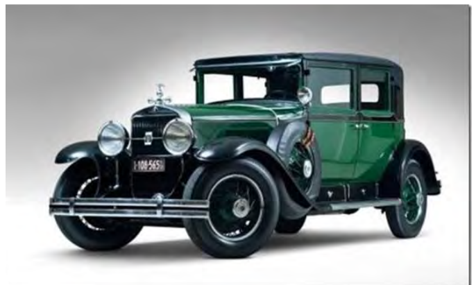
Al Capone's Car

Hours after Pearl Harbor was bombed on December 7, 1941, the Secret Service found themselves in a bind. President Franklin D. Roosevelt was to give his Day of Infamy speech to Congress on Tuesday, and although the trip from the White House to Capitol Hill was short, agents weren't sure how to transport him safely. At the time, Federal Law prohibited buying any cars that cost more than $750, so they would have to get clearance from Congress to do that, and nobody had time for that. One of the Secret Service members, however, discovered that the US Treasury had seized the bulletproof car that mobster Al Capone owned when he was sent to jail in 1931. They cleaned it, made sure it was running perfectly, and had it ready for the President the next day. Al Capone's 1928 Cadillac V-8 "Al Capone" Town Sedan Became the President's Limo on December 1941. Mechanics are said to have cleaned and checked each feature of the Caddy well into the night of December 7 th , to make sure that it would run properly the next day for the Commander in Chief. And run properly it did. It had been painted black and green to look identical to Chicago's police cars at the time. To top it off, the gangster's 1928 Cadillac Town Sedan had 3,000 pounds of armor and inch-thick bulletproof windows.